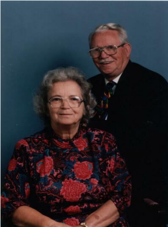
This picture was taken on August 9, 1996