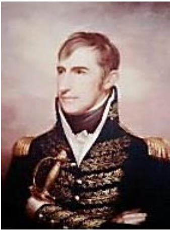
William Henry Harrison

William Henry Harrison's father, Benjamin, served in the First Continental Congress. His signature is on the Declaration of Independence. He was a soldier, senator, congressman and, later, the governor of Indiana Territory. His victory at the Battle of Tippecanoe earned him national acclaim. He was sixty-eight when he became president. Harrison caught a cold at the inauguration and died in the White House, April 4, 1841. He was the first president to die in office.