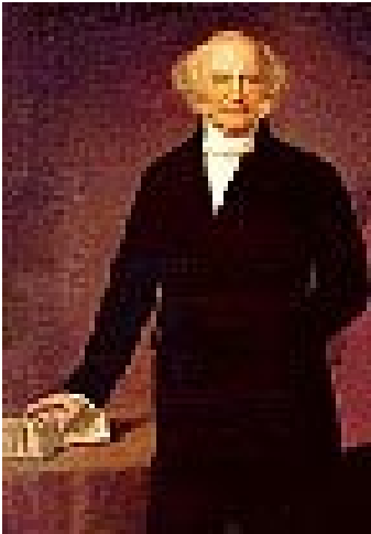
Martin Van Buren

On March 4, 1837, Martin Van Buren said early in his inaugural address: