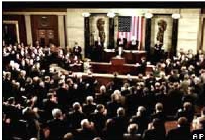
United States Congress

These 545 people spend much of their energy convincing us that what they did is not their fault. They