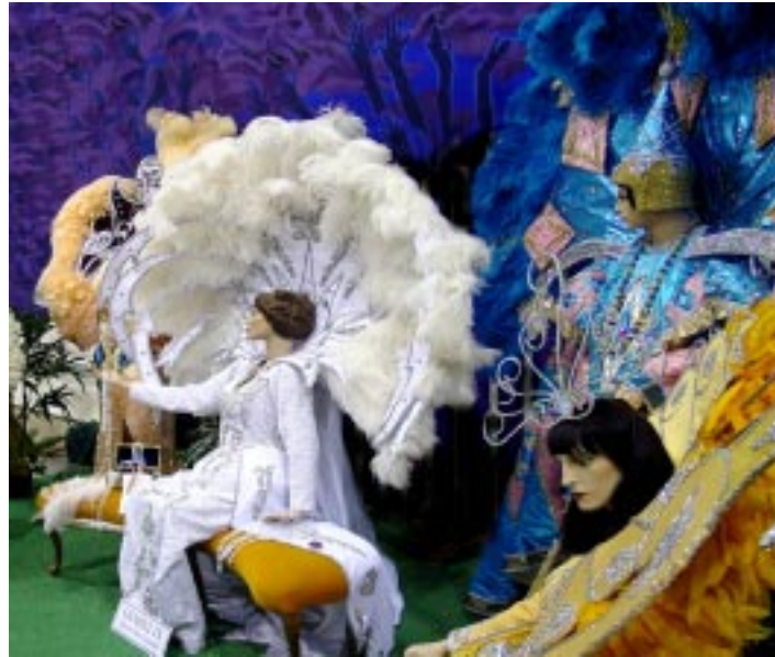
Mardi-Gras In New Orleans

[Concluding note:] I attended the Mardi Gras twice before I was saved, and I can testify that the