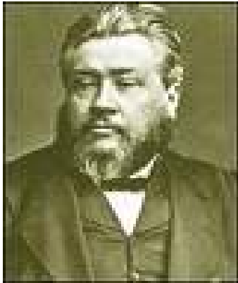
Charles H. Spurgeon

“And ye will not come to me, that ye might have life” — John 5:40)