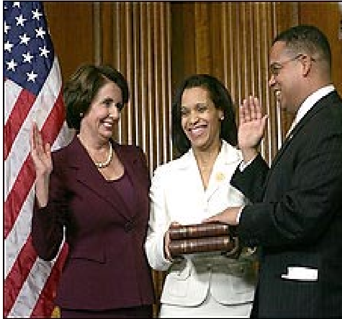
Muslim Keith Ellison being sworn in to the United States Congress with his hand upon the Quran. House Speaker Nancy Pelosi administered the oath.

There is no doubt Ellison was right about Jefferson believing wisdom could be “gleaned” from the