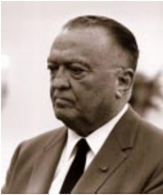
J. Edgar Hoover

Apparently there are few formal statistics relating to the efficacy of religious training in preventing crime, but let me tell you of the experience of one juvenile court judge who over a period of eight years, had some 8,000 boys and girls under 17 years of age brought before him for violating the law.