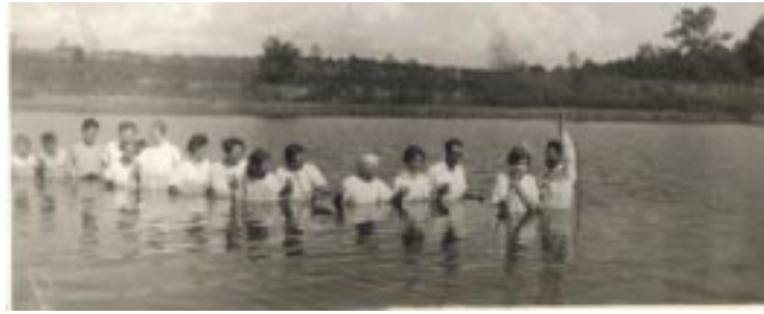
The Editor Baptizing in Tabasco, Mexico

b. A. S. Peake (Methodist of England), in speaking of Colossians 2:12 says, “The rite of baptism, in which the person baptized was first buried beneath the water and then