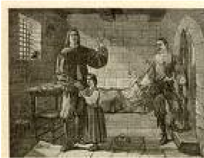
John Bunyan in Bedford Jail 1667. His blind child leaving him for the night.

John Bunyan was a Baptist preacher, a pious man, and a man well-beloved by all who knew him. John Bunyan was incarcerated in the Bedford jail in England. The following account is taken directly from a transcript of the trial on October 3, 1660, that led to his imprisonment at Bedford: