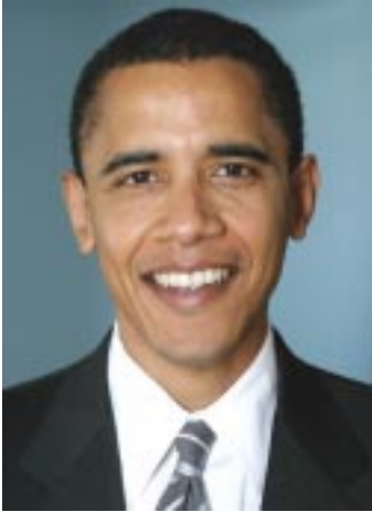
Barack Hussein Obama

The frenzy surrounding Barack Obama's U.S. presidential campaign is a little foretaste of the mindless passion that will accompany the rise of the antichrist when he comes on the scene as a man of peace and a superman problem solver.