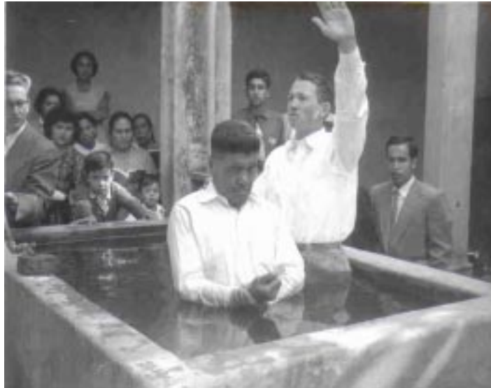
The editor baptizing the principal of a public school in Guanajuato, Mexico in 1957

church ordinance and not an individual ordinance. I don’t have the authority to go out here, and after I have preached to somebody, and after they receive Christ Jesus as their Savior, I don’t have authority to baptize them. I believe this is the emphasis of what Paul is saying. God did not send me to baptize. God sent me to preach.